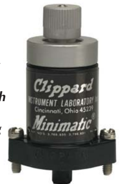
Delayed in Normally-Closed

Careful design and meticulous manufacturing allows Clippard's R-331 timing valves to run with little internal friction, resulting in a 20 million cycle life.